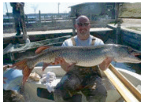
Fall muskie at Leech Lake.

http://www.exploreminnesota.com/travel-ideas/meet-minnesota-fish/index.aspx and connect with outfitters and guides at: http://www.exploreminnesota.com/things-to